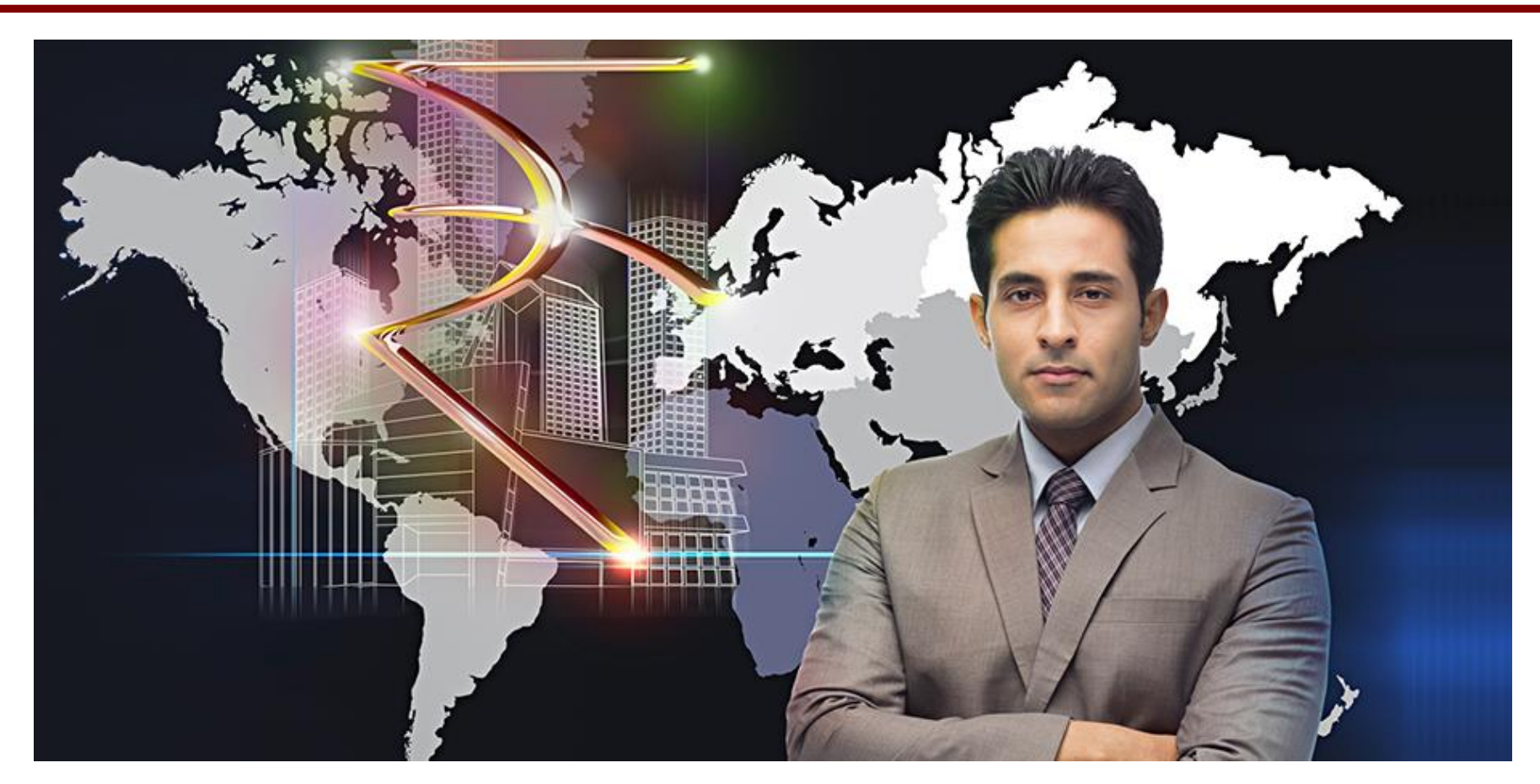
IndusForex - Online Portal Investment in Equity & Debt